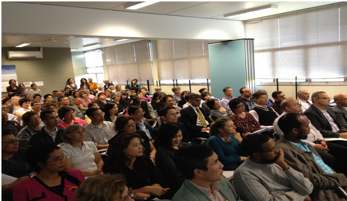
Picture: 2012 Public Meeting